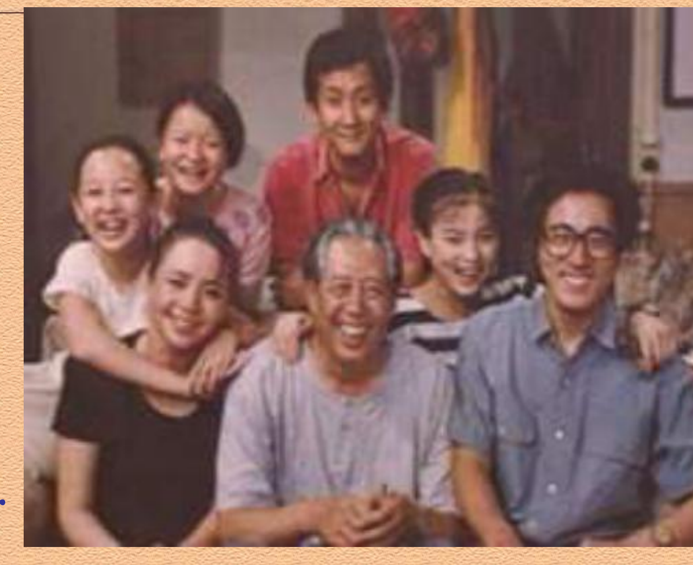
This is my/her/his ...