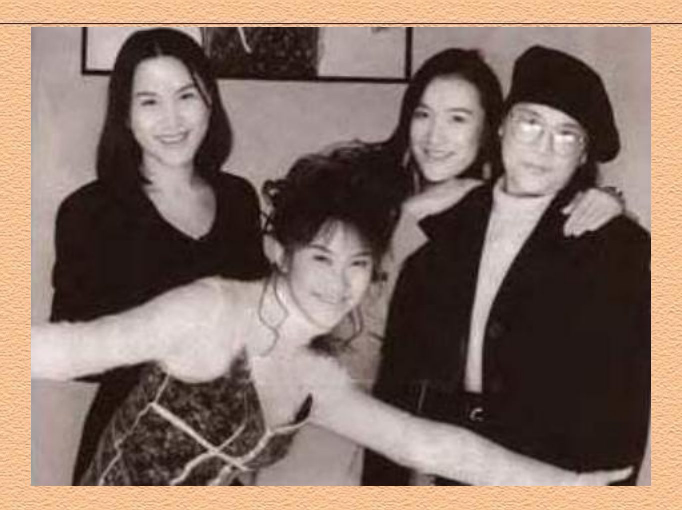
Is this her...? Yes, it is./ No, it isn't.