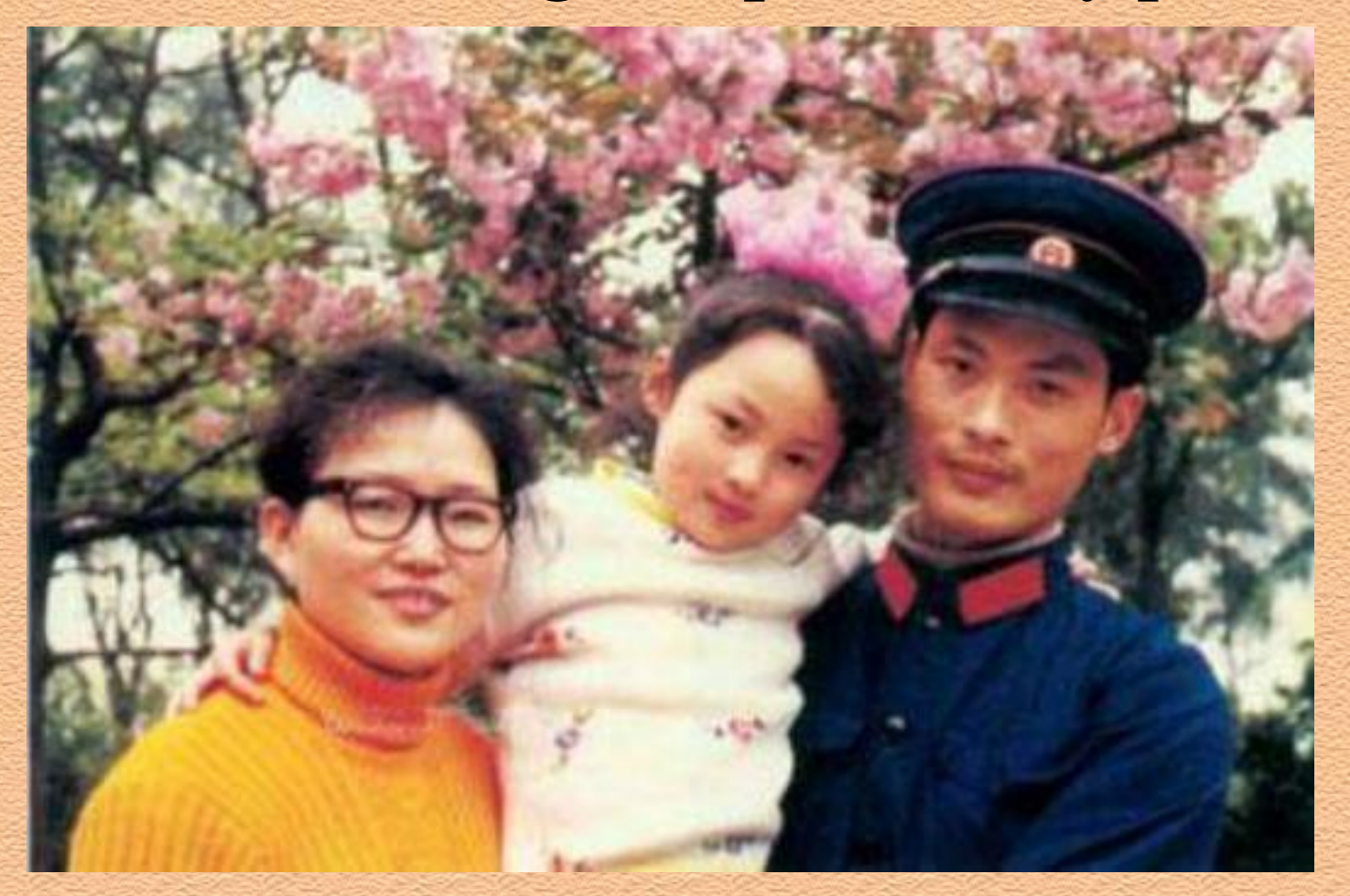
Is this her <u>mother</u> / <u>father?</u> Yes, it is./ No, it isn't.