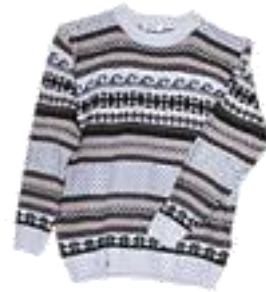
sweater grey and black