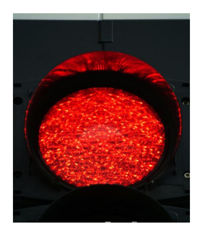
Red is stop.