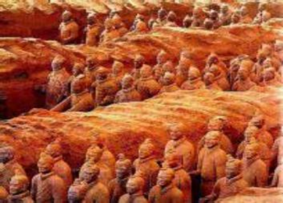
Terra Cotta Warriors