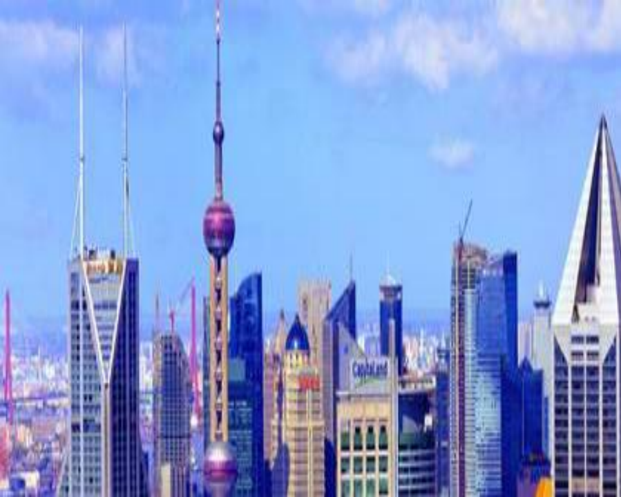
The Bund, Shanghai