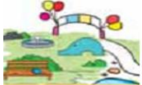
go to the park