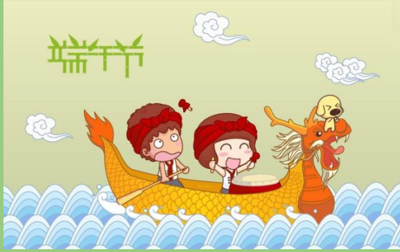
the Dragon Boat Festival