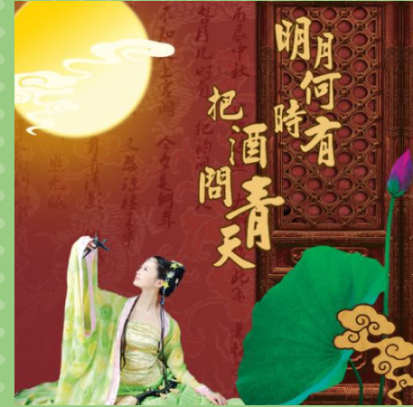
the Mid-Autumn Festival