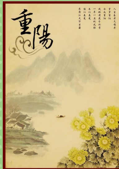
The Double Ninth Festival