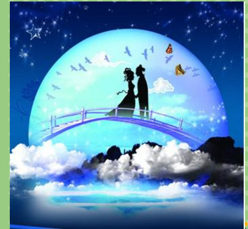
Chinese Valentine's Day, Magpie Festival