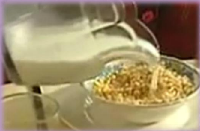
cereal and milk