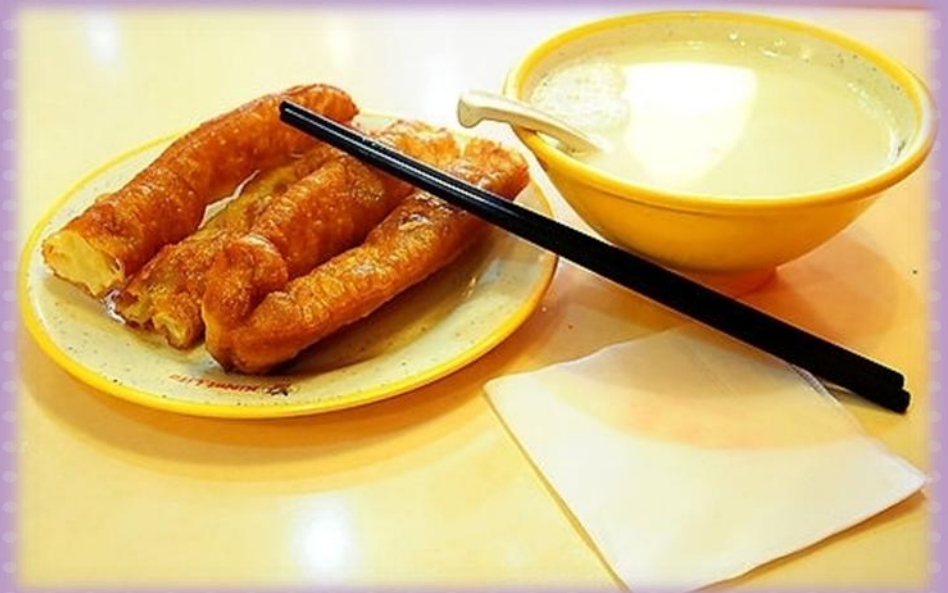
soybean milk fried bread stick