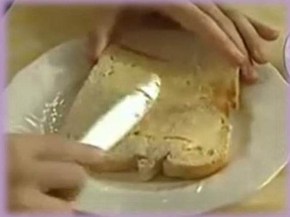
toast and jam