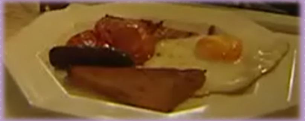
bacon, egg, sausage, tomato and fried bread