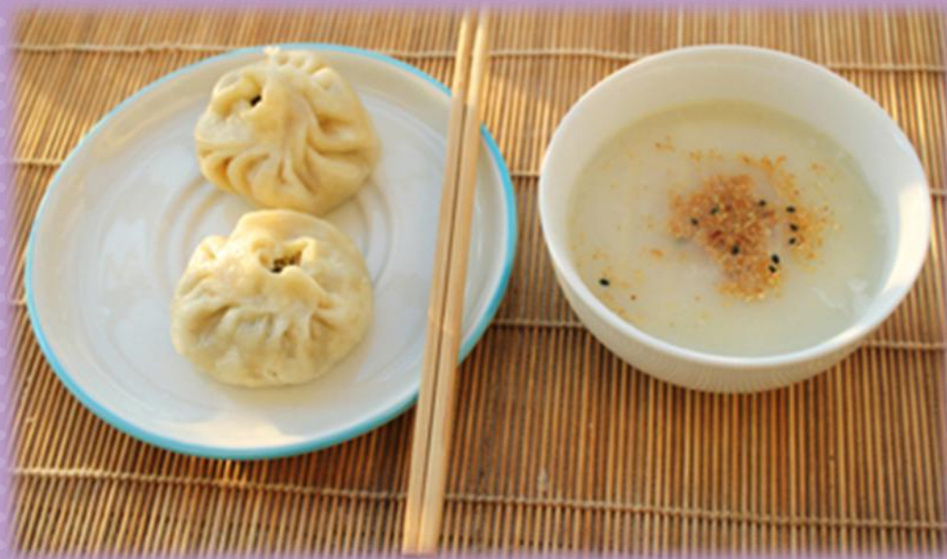
steamed stuffed bun porridge