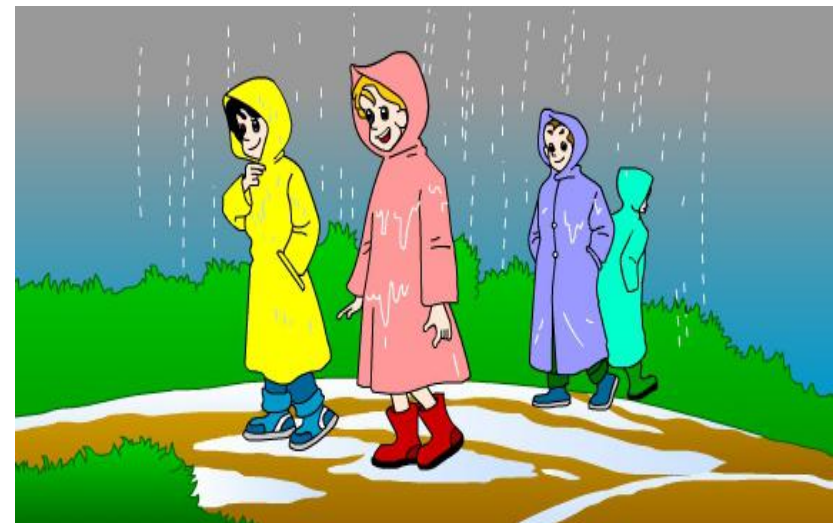
rainy / raining