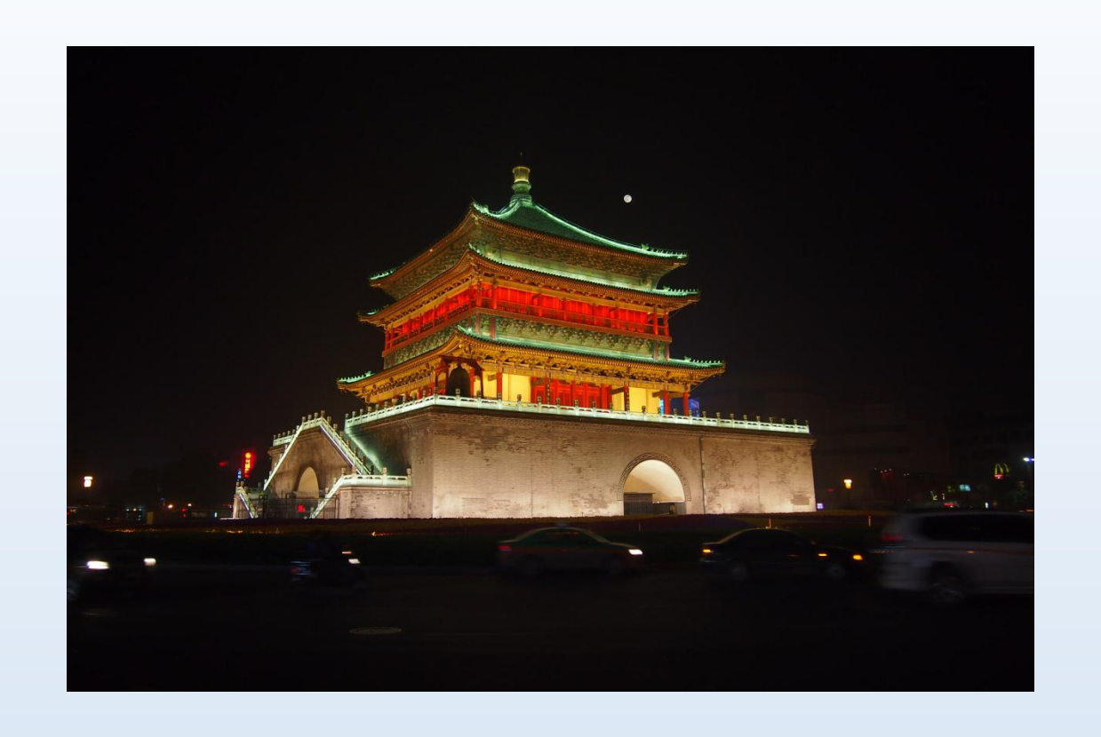
the Drum Tower hit the ancient drum