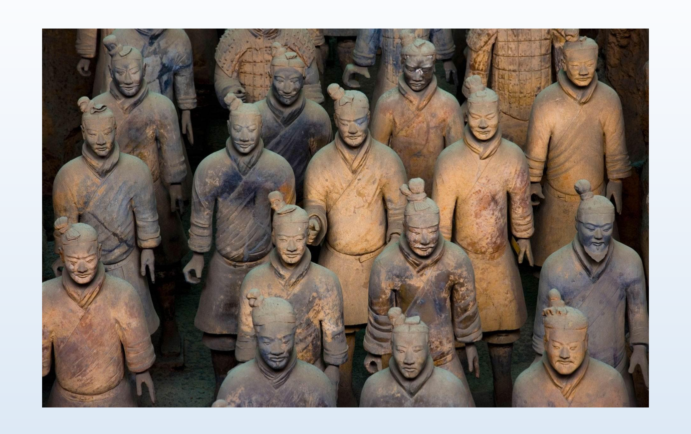
The Terra Cotta Warriors They are over 2 000 years old