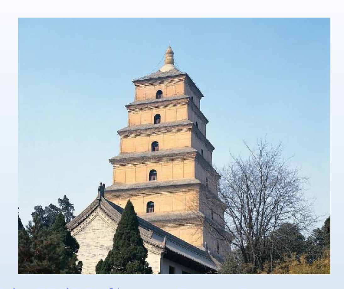
the Big Wild Goose Pagoda It is over 1 300 years old.