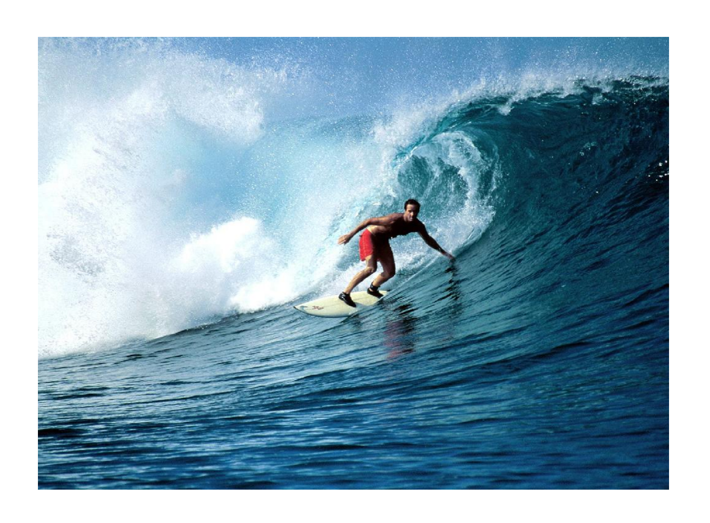
Surfing is a popular sport.