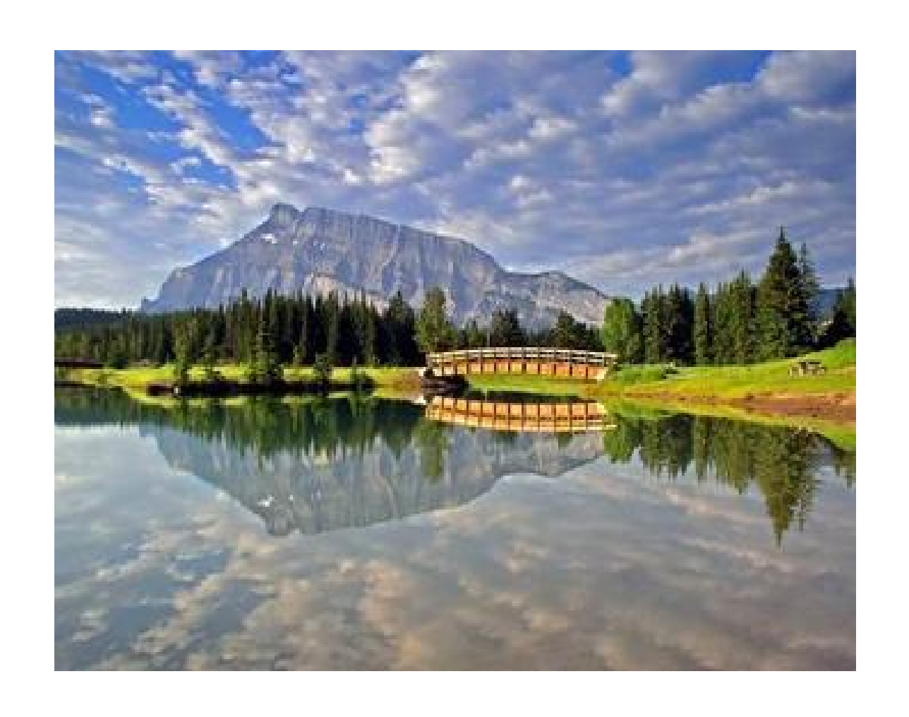
national park in western Canada