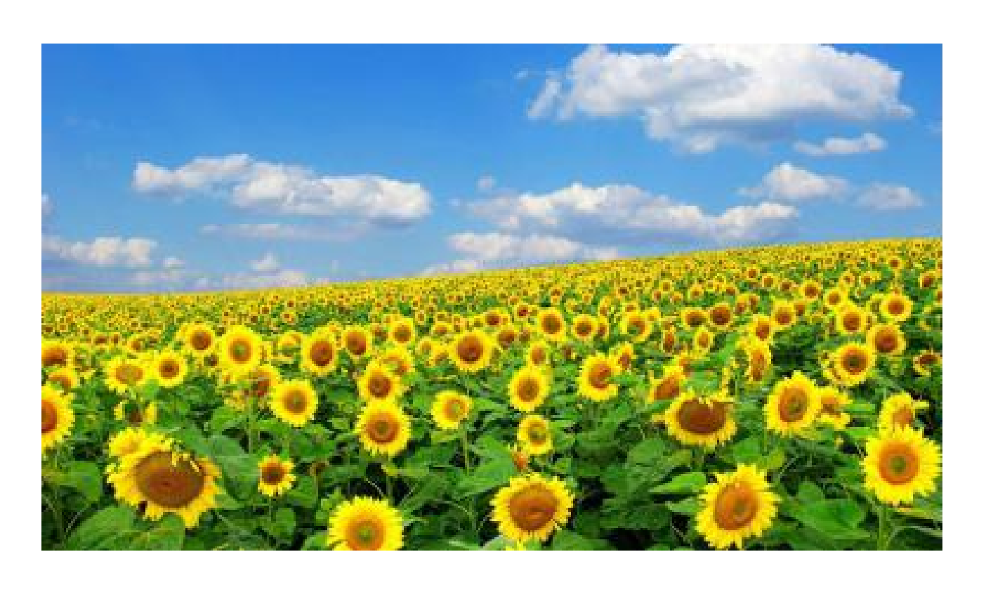
Lesson 5 Babysitting on a Spring Day