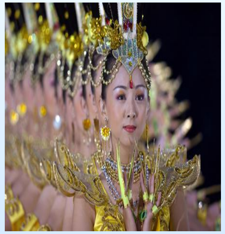
Thousands of Hands Kwan-yin.