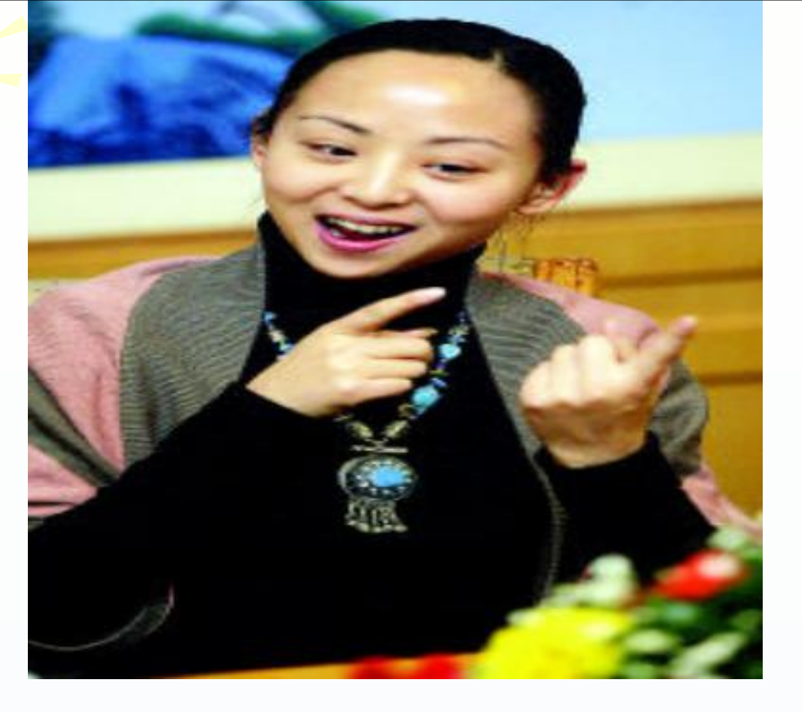
She is a deaf and dumb girl.